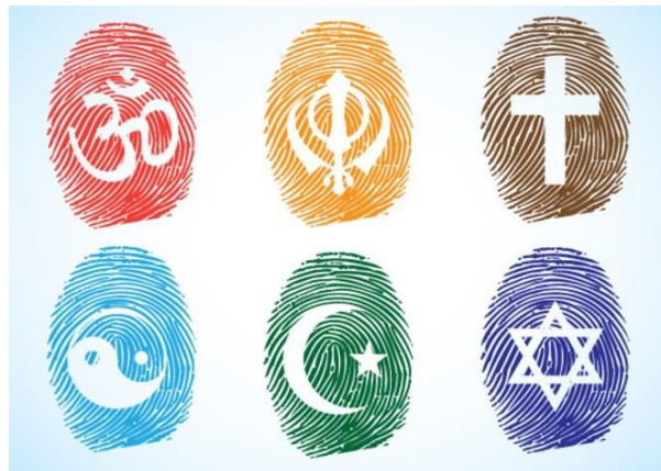
7 - R.E.

make sets of instructions in sequences and use logical reasoning to predict outcomes. We will use given commands in different orders to investigate how the order affects the outcome.