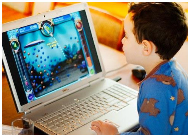
11 - Useful websites

Create art work that reflects our topic themes - don't forget to bring it into school to show us!