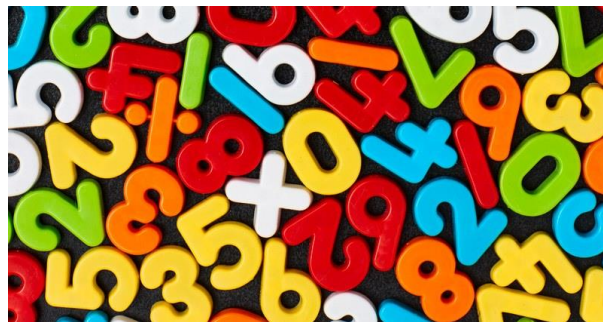
1 - Maths

There will also be a selection of fiction and non-fiction books in the classroom to support the children's learning and interest in our topic.