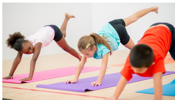
8 - PE

We will learn all about places of worship and the similarities and differences between these in the varying religions. We will focus on the religion of Islam and children will gain confidence discussing the importance of Allah to Muslims.